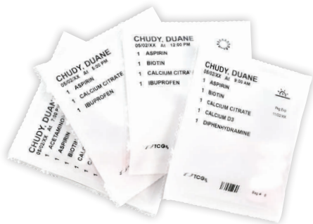
Automated multi-med packaging for outpatient locations.