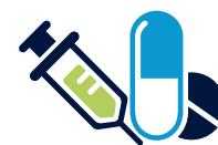
LDD and Payor Access