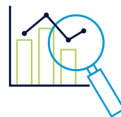
Financial Opportunity Analysis