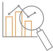
Financial Opportunity Analysis

SPARx provides expertise in specialty pharmacy , ambulatory , and infusion services empowering healthcare organizations to own their own specialty pharmacy and associated revenue stream.