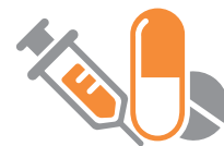
LDD and Payor Access