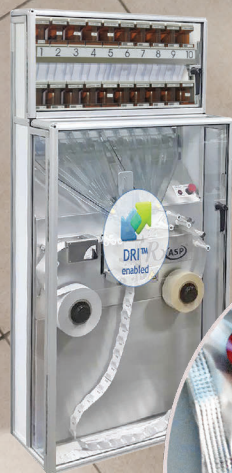
RxASP 20 Strip Packager