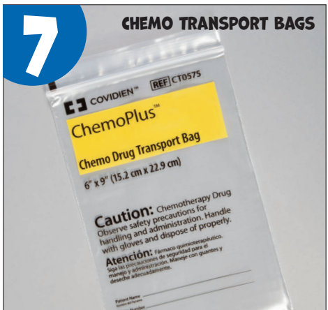
7 CHEMO TRANSPORT BAGS

COVIDIEN™ REF: CT0575 ChemoPlus™ Chemo Drug Transport Bag 6" x 9" (15.2 cm x 22.9 cm) Caution: Chemotherapy Drug Observe safety precautions for handling and administration. Handle with gloves and dispose of properly. Atención: Farmaco quimioterapéutico. Seguir las precauciones de seguridad para el manejo y administración. Manejar con guantes y desechar adecuadamente.