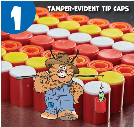
1 TAMPER-EVIDENT TIP CAPS