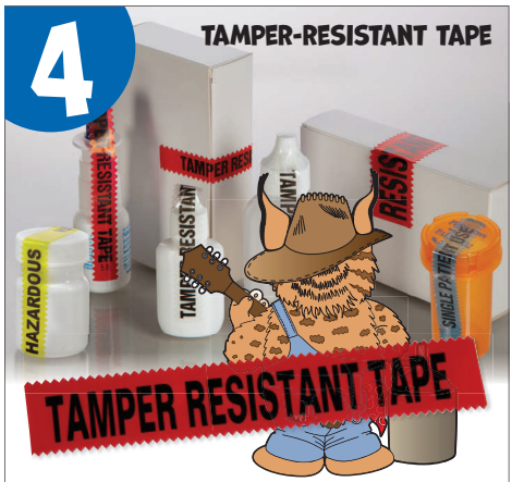
4 TAMPER-RESISTANT TAPE