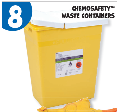
8 CHEMOSAFETY™ WASTE CONTAINERS

COVIDIEN™ REF: CT0575 ChemoPlus™ Chemo Drug Transport Bag 6" x 9" (15.2 cm x 22.9 cm) Caution: Chemotherapy Drug Observe safety precautions for handling and administration. Handle with gloves and dispose of properly. Atención: Farmaco quimioterapéutico. Seguir las precauciones de seguridad para el manejo y administración. Manejar con guantes y desechar adecuadamente.