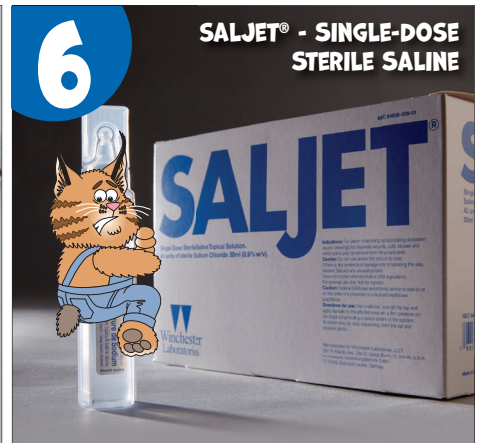
6 SALJET® - SINGLE-DOSE STERILE SALINE