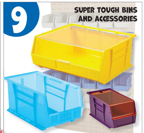
9 SUPER TOUGH BINS AND ACCESSORIES