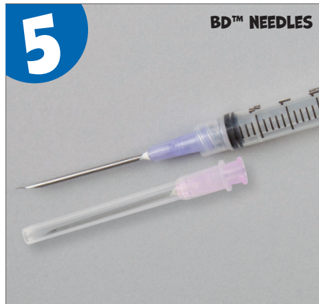
5 BD™ NEEDLES