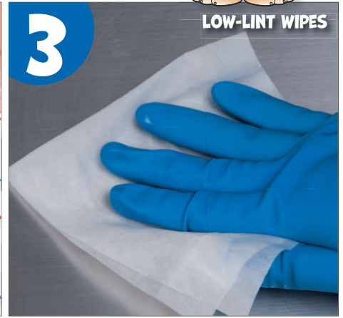
3 LOW-LINT WIPES