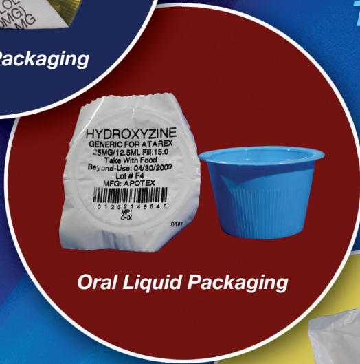
Oral Liquid Packaging