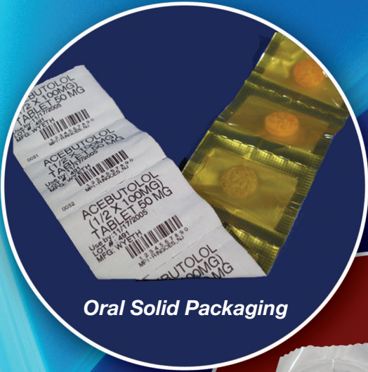
Oral Solid Packaging

*Also capable of 7 day or less dispensing!