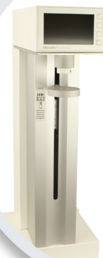
THE NEW UNGUATOR Q

HES actively and consistently attends national, local, and state shows and conferences. Look for our booth this year at NCPA, IACP Compounding on Capitol Hill, APhA, ACA Mid-Year Meeting, and many more!