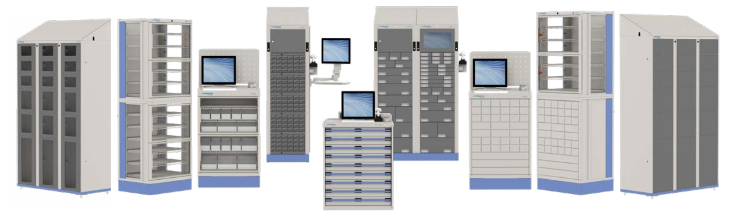
Touch Point Medical's \ med Dispense @ \ series \ gives \ you \ the \ control \ and \ flexibility \ to \ choose \ the \ most \ efficient \ way \ to \ safely \ store \ and \ dispense \ medications.